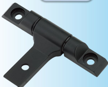
3D Rendered View